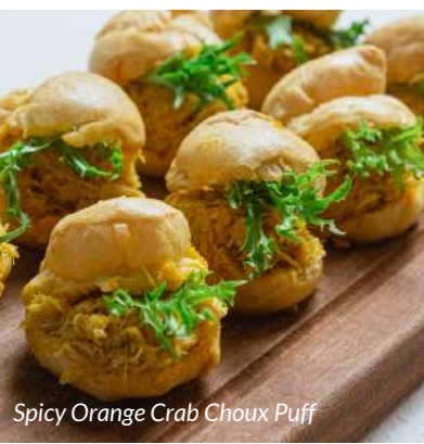
Spicy Orange Crab Choux Puff