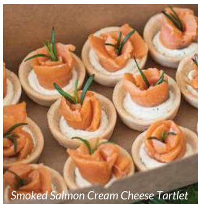
Smoked Salmon Cream Cheese Tartlet