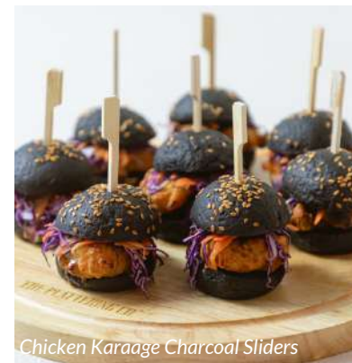
Chicken Karaage Charcoal Sliders