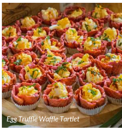
Egg Truffle Waffle Tartlet