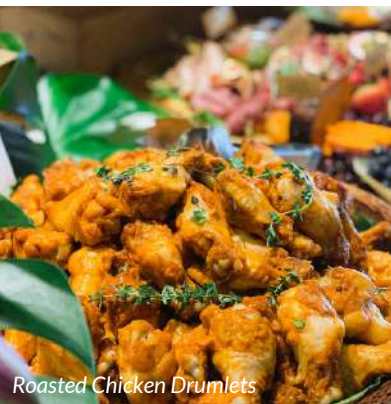
Roasted Chicken Drumlets

Serves 10 pax | 12cups, vegetarian Colourful and healthy cups filled with fresh raw vegetables and a housemade dip.