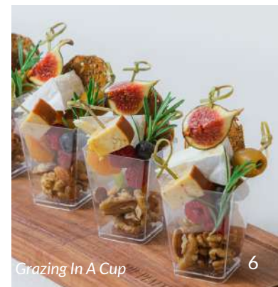
Grazing In A Cup