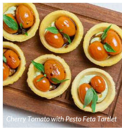
Cherry Tomato with Pesto Feta Tartlet