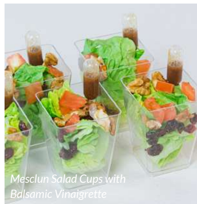
Mesclun Salad Cups with Balsamic Vinaigrette