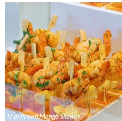
Thai Prawn Mango Skewer