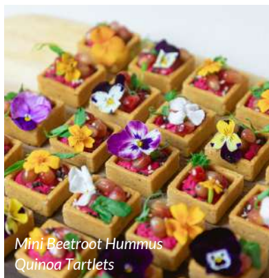
Mini Beetroot Hummus Quinoa Tartlets