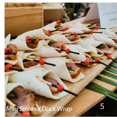
Mini Smoked Duck Wrap