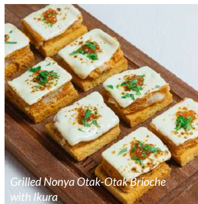
Grilled Nonya Otak-Otak Brioche with Ikura