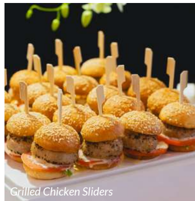
Grilled Chicken Sliders