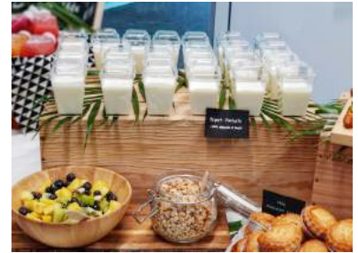
YOGHURT PARFAIT served with granola and fresh fruits [gluten-free option available]