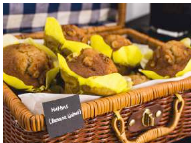
MUFFIN (Choose 2 from the following) • blueberry • banana walnut • double chocolate • almond raisin [gluten-free option available]