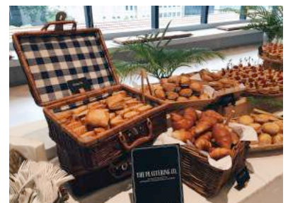
MINI PASTRIES (Choose 2 from the following) • mushroom pie • chicken pie • curry puff • pain au chocolat • raisin swirl