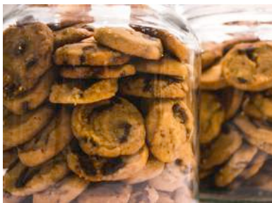
COOKIE JAR (Choose 1 from the following) • chocolate chip • coconut • earl grey • orange cranberry • oatmeal • almond biscotti [eggless option available]