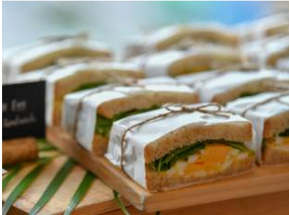
Truffle Egg Salad

generous egg filling, fresh rocket, mayonnaise and truffle oil