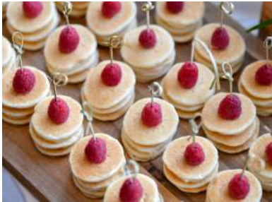
MINI PANCAKE STACK served with maple syrup and fresh berries

*premium items-additional charge per pax applies for items selected