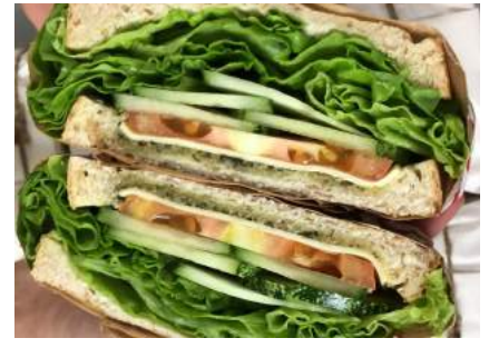
Pesto with Seasonal Greens (veg)

chicken ham, cheddar cheese, fresh greens, homemade dressing