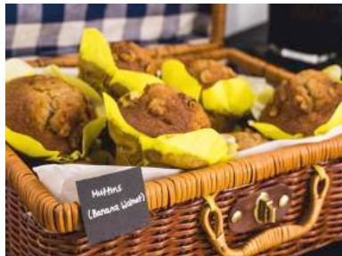
MUFFIN (Choose 2 from the following) • blueberry • banana walnut • double chocolate • almond raisin [gluten-free option available]