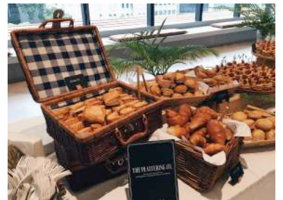
MINI PASTRIES (Choose 2 from the following) • mushroom pie • chicken pie • curry puff • pain au chocolat • raisin swirl