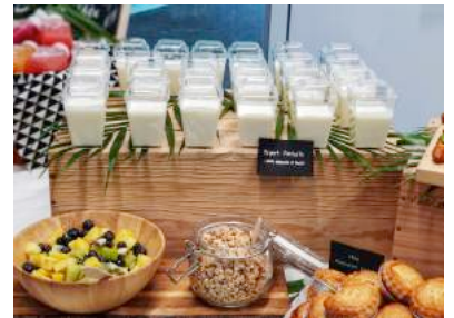
YOGHURT PARFAIT served with granola and fresh fruits [gluten-free option available]