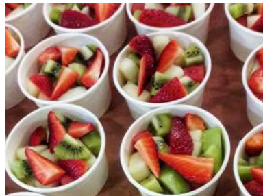
FRUIT BOWL assorted seasonal fruit