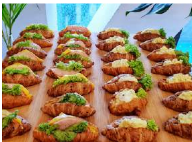
MINI CROISSANT (Choose 1 from the following) • chicken ham & cheese • egg truffle mayonnaise • cream cheese with cucumber (veg)