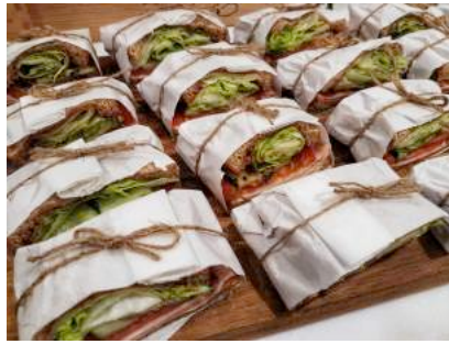
Classic Chicken Ham and Cheese

generous egg filling, fresh rocket, mayonnaise and truffle oil